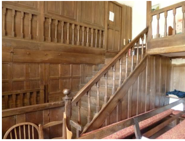
Fig.3: ministers' stand and fixed benches to south Fig.4: staircase and panelling to west wall side