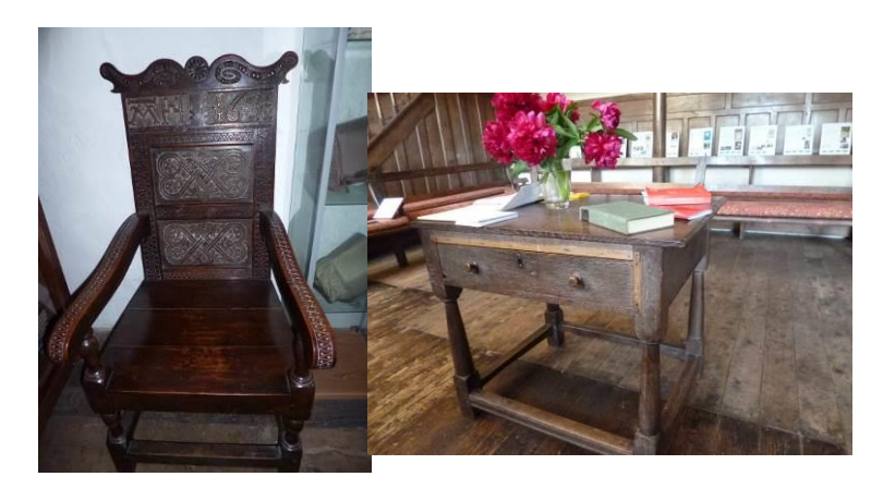
Fig.5: settle made by Arthur Fig.6: chair dated 1671 Fig.7: oak table, c1700 Simpson, 1911.