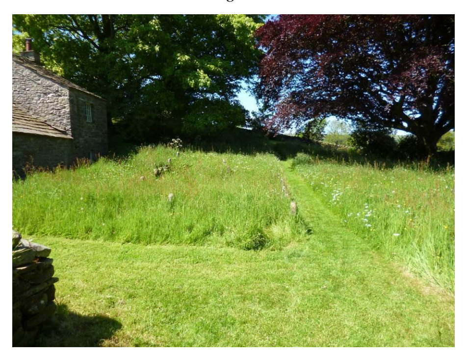
Fig.8: burial ground from the east

rectangular area is enclosed by dry stone walls and laid to grass, with the plain round-headed headstones arranged in rows aligned east-west. The headstone of poet Basil Bunting (died 1985), author of the poem Brigflatts, is along the north side. On the north wall of the stable building are recent memorial tablets recording cremations.