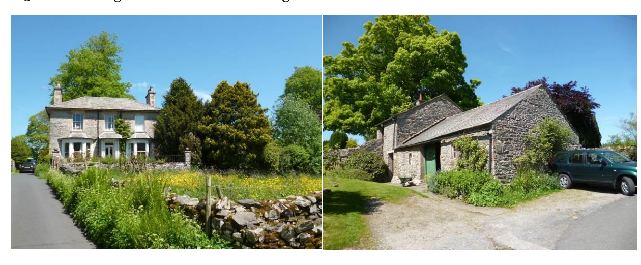
Fig.9: Rosebank, the wardens' house